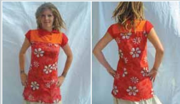
Art. Nr. 3016