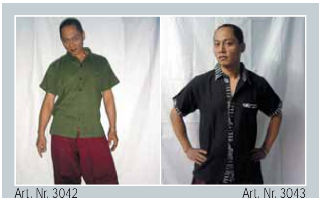
Art. Nr. 3042