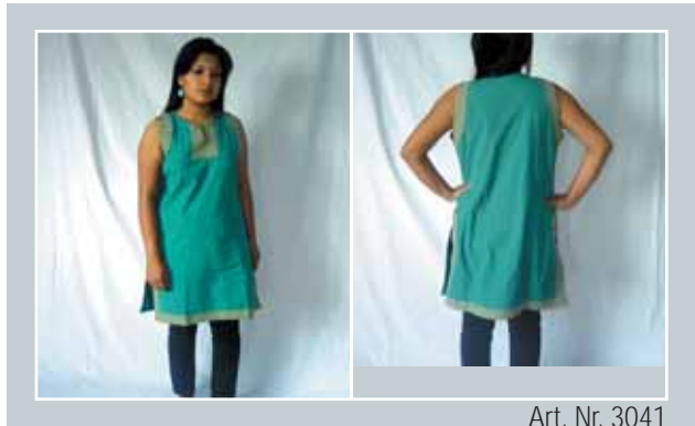
Art. Nr. 3041