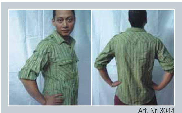
Art. Nr. 3044