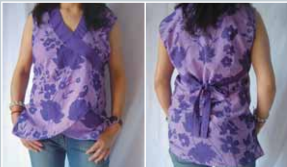
Art. Nr. 3013