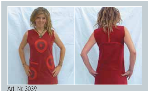
Art. Nr. 3039