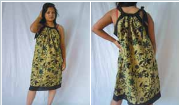
Art. Nr. 3024