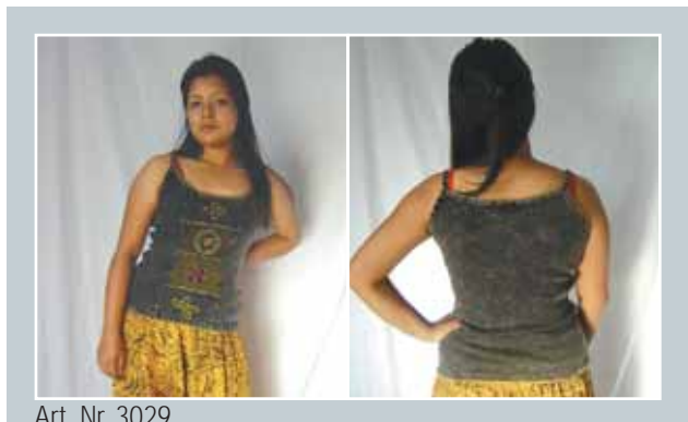
Art. Nr. 3029