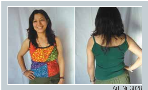
Art. Nr. 3028