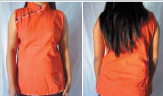
Art. Nr. 3012