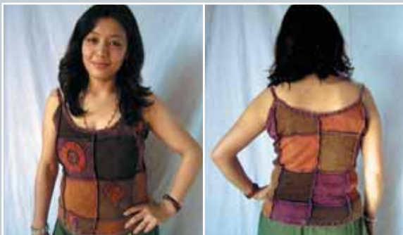
Art. Nr. 3026