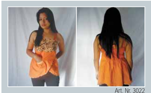
Art. Nr. 3022