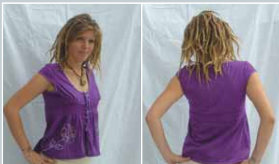
Art. Nr. 3046