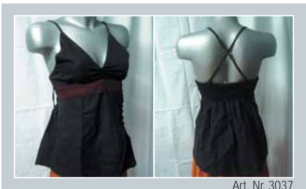
Art. Nr. 3037