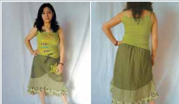
Art. Nr. 3025