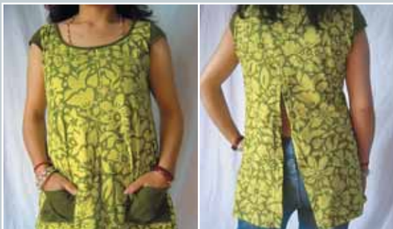
Art. Nr. 3014