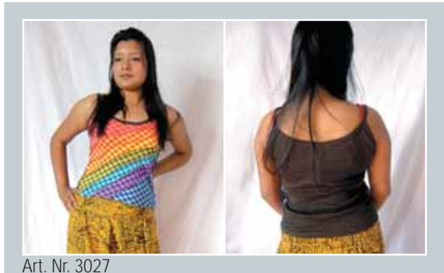
Art. Nr. 3027