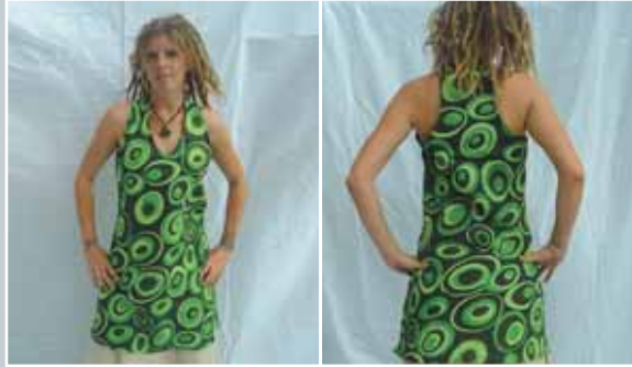
Art. Nr. 3015