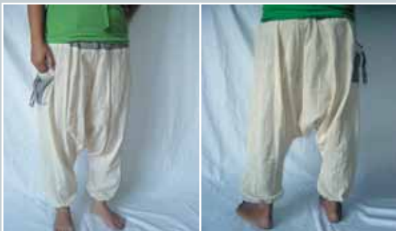
Art. Nr. 3032