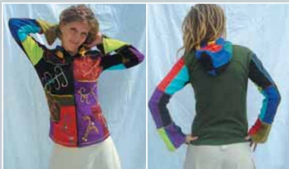
Art. Nr. 3048