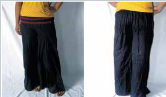
Art. Nr. 3034