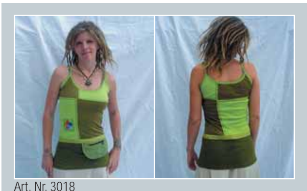
Art. Nr. 3018