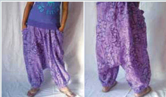
Art. Nr. 3030