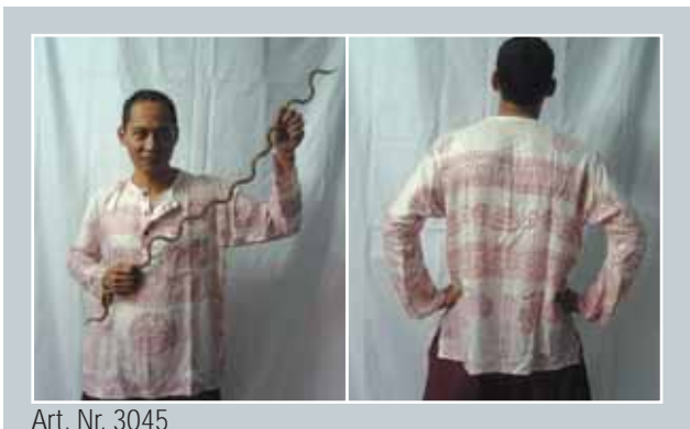
Art. Nr. 3045