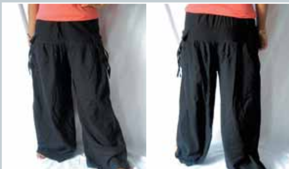
Art. Nr. 3035