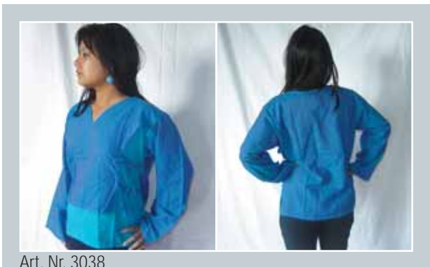
Art. Nr. 3038