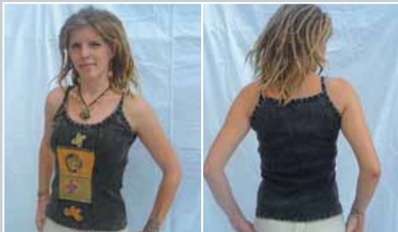
Art. Nr. 3047