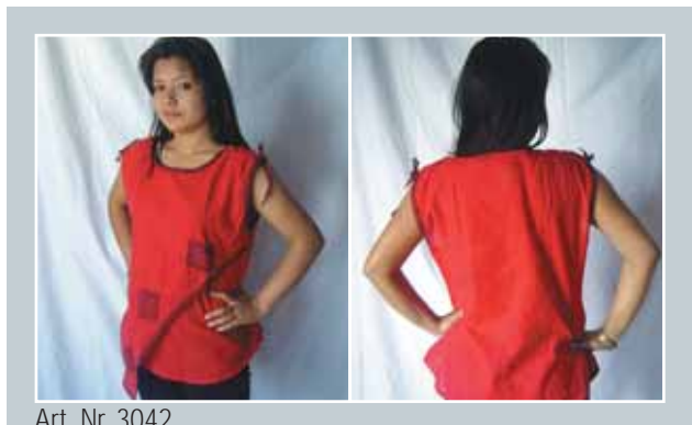
Art. Nr. 3042