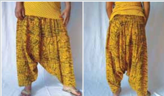
Art. Nr. 3031