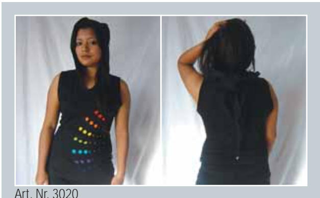
Art. Nr. 3020