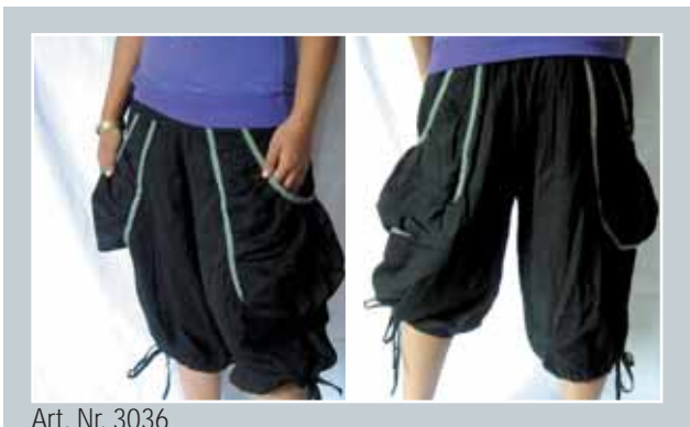
Art. Nr. 3036