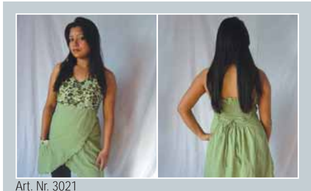
Art. Nr. 3021