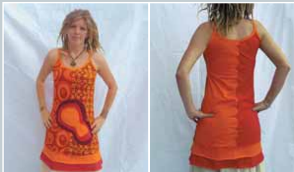
Art. Nr. 3017