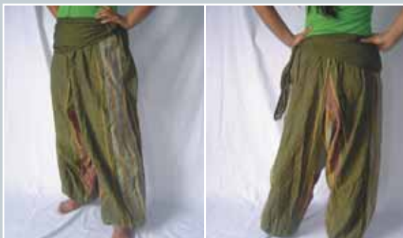
Art. Nr. 3033