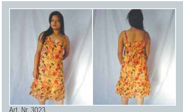
Art. Nr. 3023